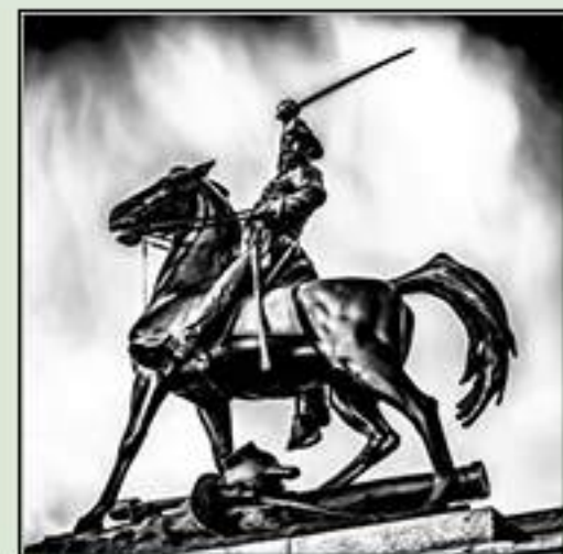
A statue of Meagher, on horseback with sword raised, is on the front lawn of the Montana State Capitol in Helena, and was erected in 1905. A similar statue honoring him was erected in 2004 in Waterford, Ireland near his childhood home.